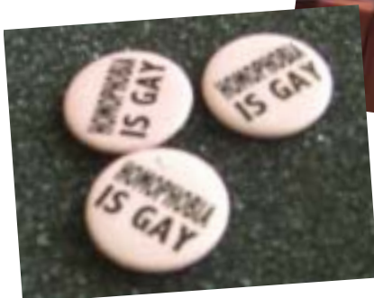
Pictures, from top: the DELGA AGM; homophobic bullying campaign fringe meeting; equalities fringe meeting; LDYS' campaign pin badges - coming to a uni near you soon!